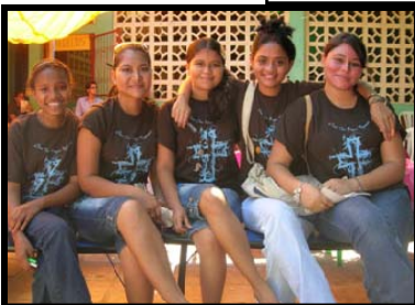
Below: Youth from Guadalupe Church of Christ hang out in the shade. Right: This little one, suffering from a bad cold, waits to see a doctor.

When I look back on all that took place in order to share the love of Christ, I can only say, "Thank you, Lord, for allowing me to share in this ministry with such a wonderful group of people."