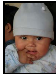
Patients at Project H.O.P.E. medical clinics range from babies to the elderly.