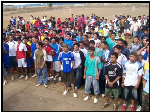
Ready to play on the soccer field of dirt, these youth hear the salvation message in a way they understand through the ball of many colors.