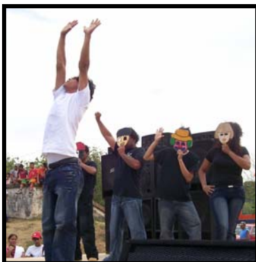
The drama team performs before the message is shared.

I was so pleased with the Staff of Project H.O.P.E. It was an awesome experience to work with such a great team. I will value this experience for the rest of my life. Thank you Project H.O.P.E., and thanks from all the new brothers and sisters in Christ. As I told them at the games, only one team comes out a winner – every team in the tournament lost at least one game – BUT ON GOD'S TEAM, WE ALL COME OUT WINNERS!